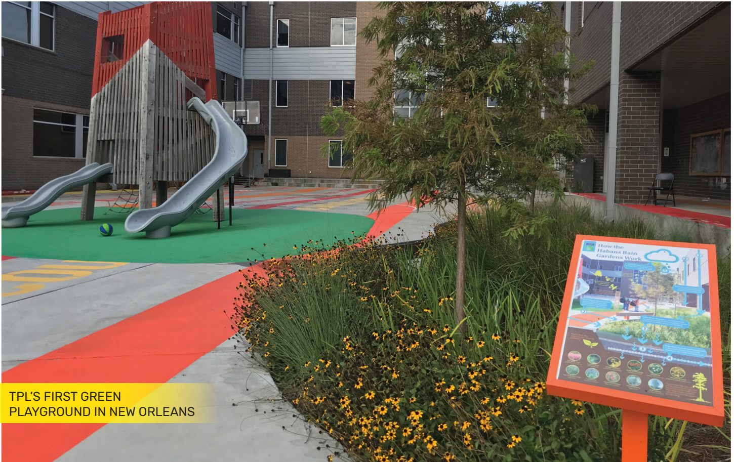
TPL'S FIRST GREEN PLAYGROUND IN NEW ORLEANS